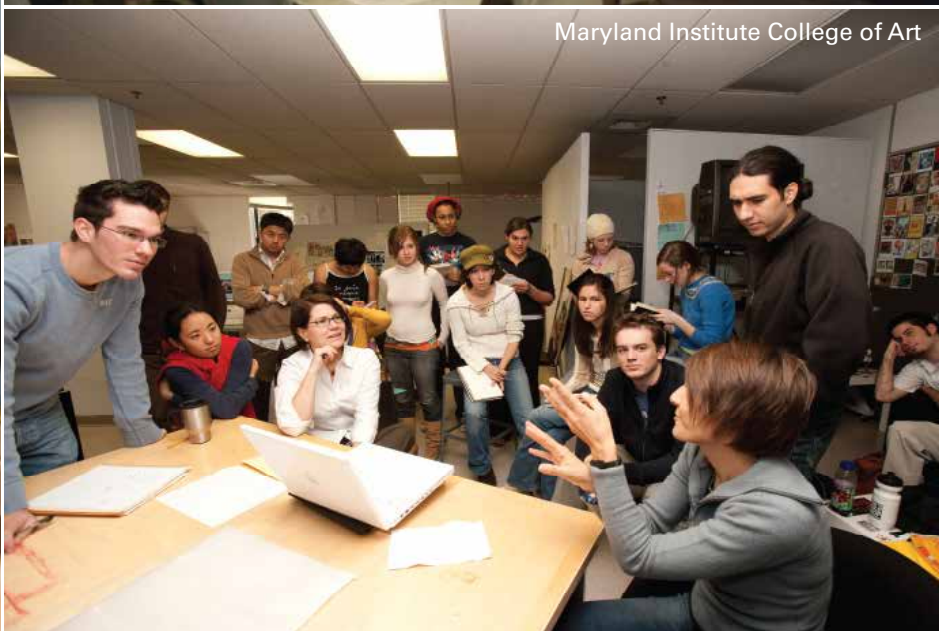
Maryland Institute College of Art