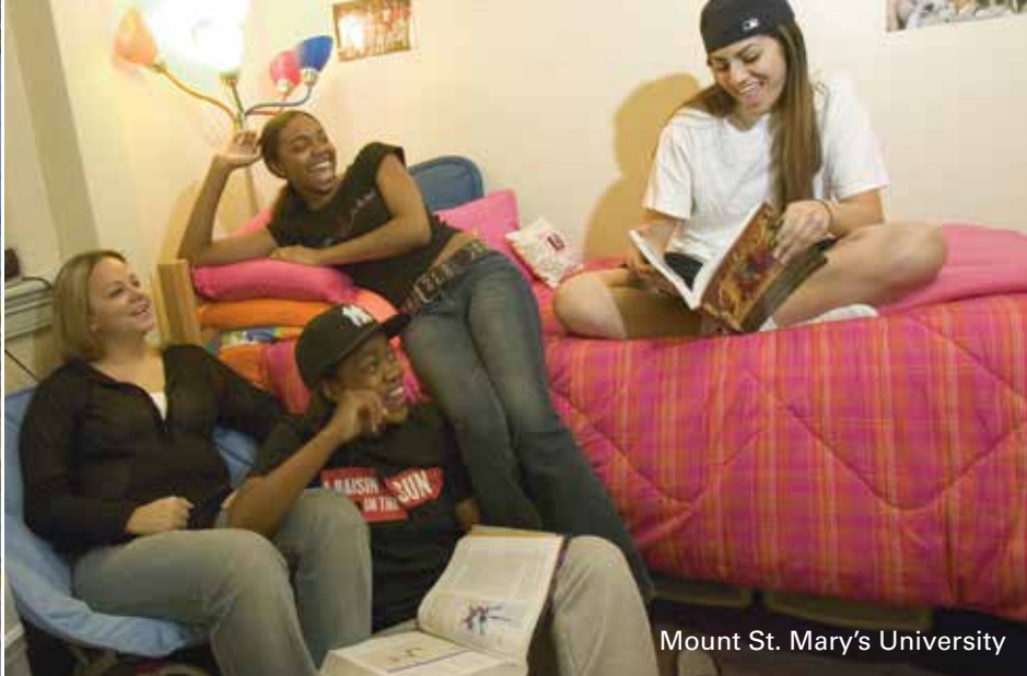
Mount St. Mary's University