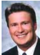
Sen. BARRY GLASSMAN Washington College