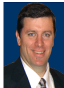
Sen. BRYAN SIMONAIRE Loyola College in Maryland