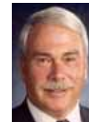
Sen. JAMES ROBEY Hood College