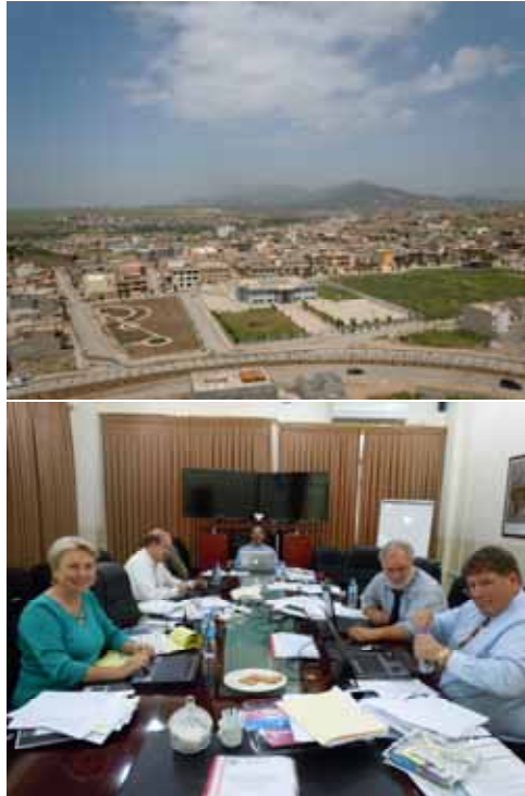
Top: Aerial view of the American University of Iraq-Sulaimani