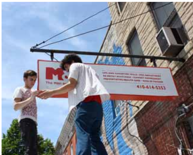
MICA Design Coalition student and AmeriCorps VISTA member install the new MICA PLACE sign in East Baltimore.

MICA PLACE will be a hub for graduate study, preparing students for civic-minded careers in action-oriented community arts and social design work, as well as other professions. It will support community development, revitalization, and health and well-being in East Baltimore and beyond through community/college engagement, educational programs, and the development, documentation, and dissemination of new knowledge and resources. ■